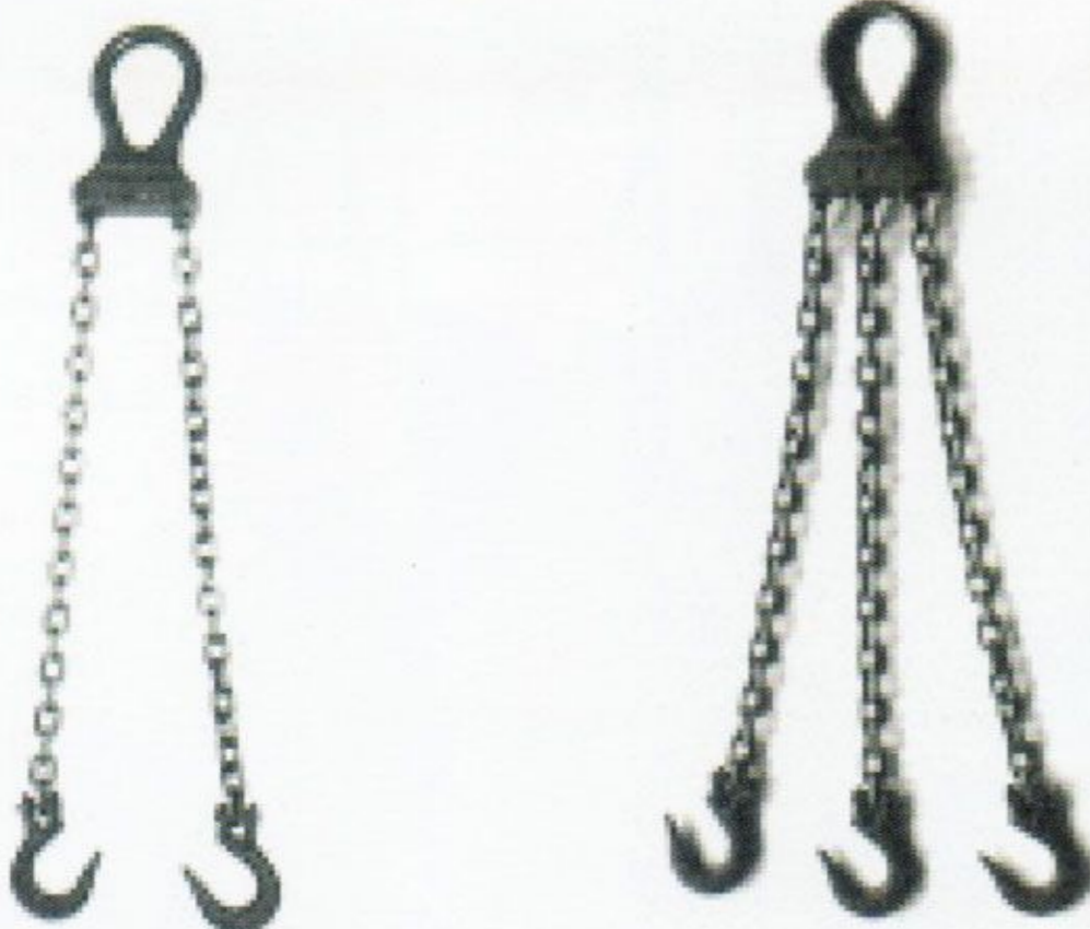
Chain Sling Assembly Type