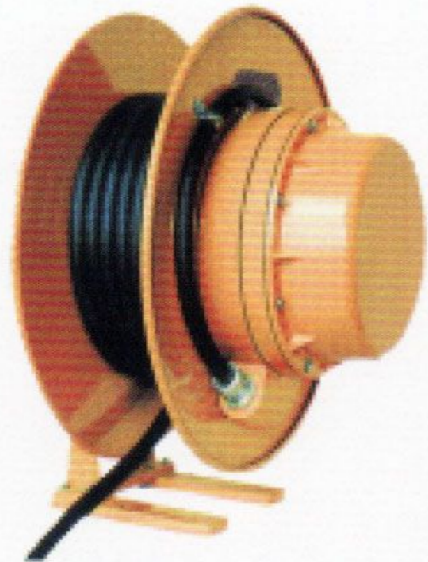
Cable Reel (Spring)